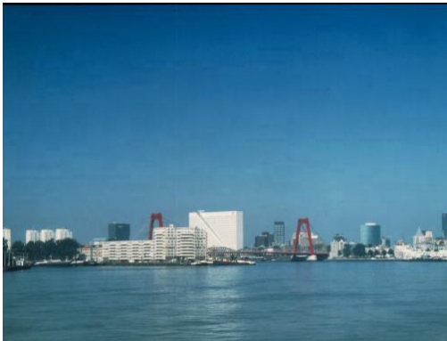
Rotterdam Downtown Waterfront

Following the devastation of the 1940-bombing, Rotterdam has completely rebuilt its downtown into a modern office and retail district. Today, however, its dominant economic function has raised concerns about public safety and livability. To address this, CityCorp, a consortium of seven Rotterdam housing corporations, aims to return the residential function in downtown Rotterdam. Using a Downtown Mosaic concept, CityCorp formulated a development strategy that contains both qualitative and quantitative strategies to stimulate the residential function. CityCorp's goal is to double the number of housing units (6,000 to 8,000 additional units) and create a 24-hour mixed use community with a healthy service economy and high-quality public spaces. CityCorp has agreed on a comprehensive development approach. The development strategy will reinforce the different identities in the downtown area: high-rise along with low-rise, chic as well as shabby. Building on pioneering work for the Amsterdam consortium Far West, we supervised the establishment of the development consortium CityCorp and formulated the development concept and framework for Downtown Mosaic.