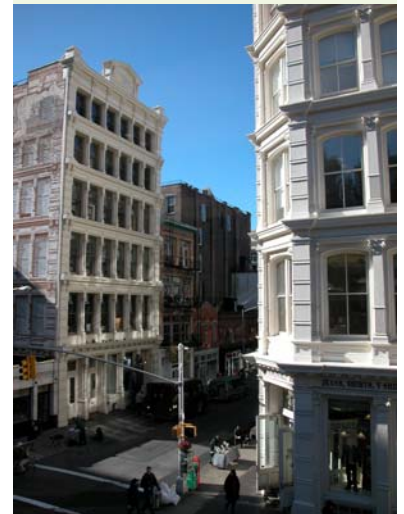
Lofts on Prince Street